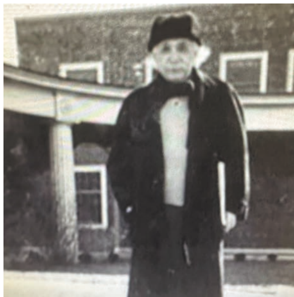
Albert Einstein at the Bordentown School

In 1947, New Jersey adopted a state constitutional provision 3 that prohibited public school segregation and required the Bordentown School to integrate the following year. 4