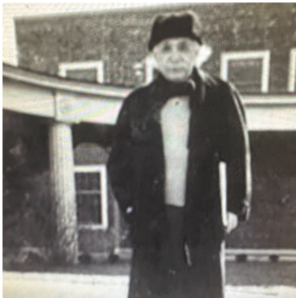
Albert Einstein at the Bordentown School; From A Place Out of Time: Bordentown School

In 1947, New Jersey adopted a state constitutional provision 3 that prohibited public school segregation and required the Bordentown School to integrate the following year. 4