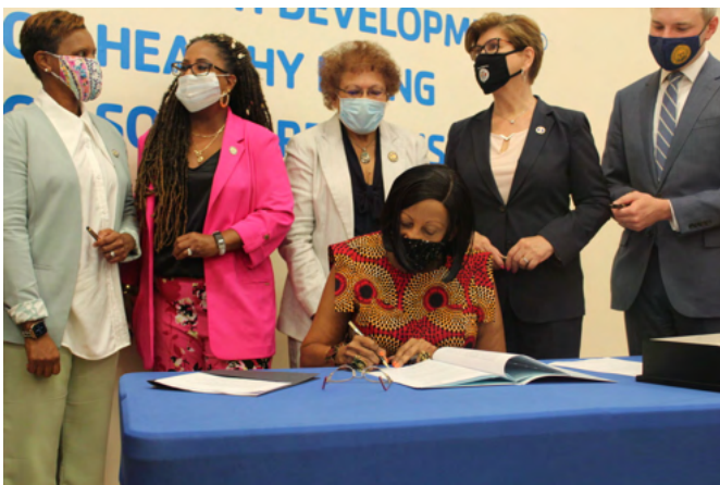
New Jersey Lt. Governor Sheila Oliver signs the Restorative and Transformative Justice for Youths and Communities Pilot Program bill (S2924) into law.

Here in New Jersey, advocacy groups have been calling for funding to be reallocated away from the criminal justice system toward community resources. Beginning with the launch of the 150 Years is Enough Campaign to close New Jersey's youth prisons, the Institute has been a statewide leader in the effort to close New Jersey's broken youth prisons and reinvest in communities. The campaign has achieved a number of successes, including the closure announcement of two of New Jersey's youth prisons, New Jersey becoming the first state in the nation to test all of its incarcerated youth for COVID-19 and the release of over 100 young people from our state's youth facilities in response to the virus. The Institute has also