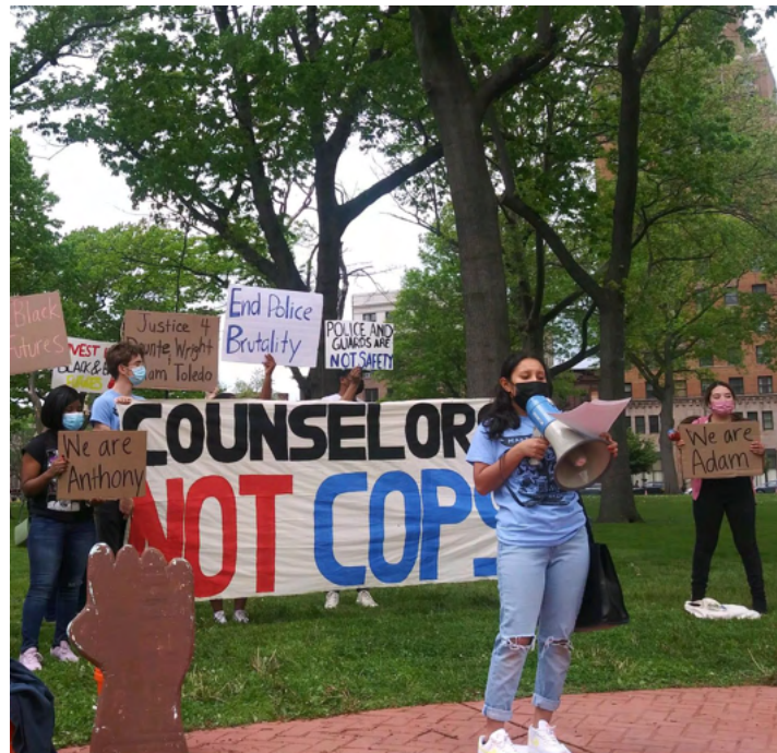
The Institute partnered with Make the Road for a youth rally in Newark's Lincoln Park. (May 4, 2021)

Make the Road New Jersey, an advocacy organization working for the rights of immigrant, working class and Latina/Latino communities, 111 has led a campaign to remove police from schools and reinvest those funds into hiring more school nurses and counselors. 112 The Institute has partnered with Make the Road for multiple rallies in support of this movement. 113