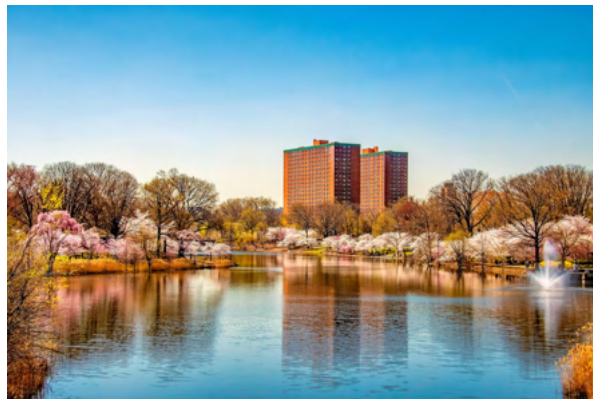
Newark crime rates reached a 50-year low.

High-risk interventionists are community members and impacted people who are trained to respond to disputes. 78 Following the implementation of the NCST, Newark crime rates began rapidly falling, reaching a 30-year low for homicides and a 50-year low for overall crime in 2019. 79 Beyond the NCST, there are several other successful community-based violence prevention programs throughout New Jersey, including the Paterson Healing Collective 80 and Jersey City Anti-Violence Coalition Movement. 81