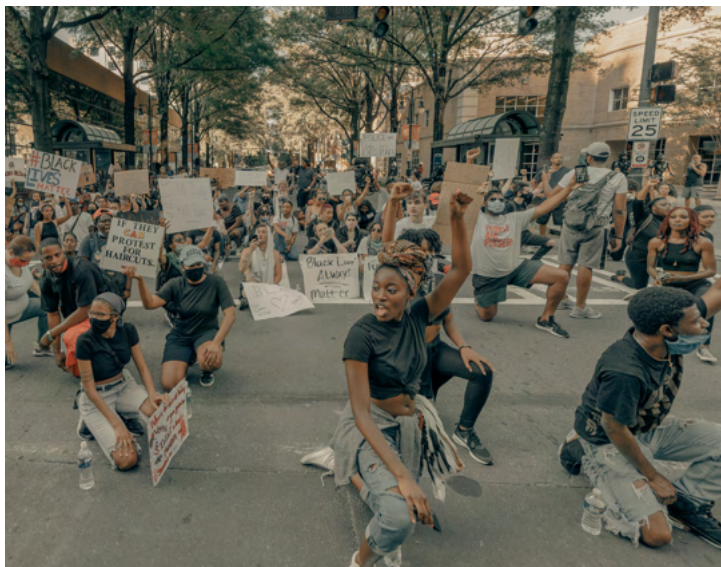
Protests erupted across the U.S. in 2020 as police violence against Black communities was recorded and spread across social media.