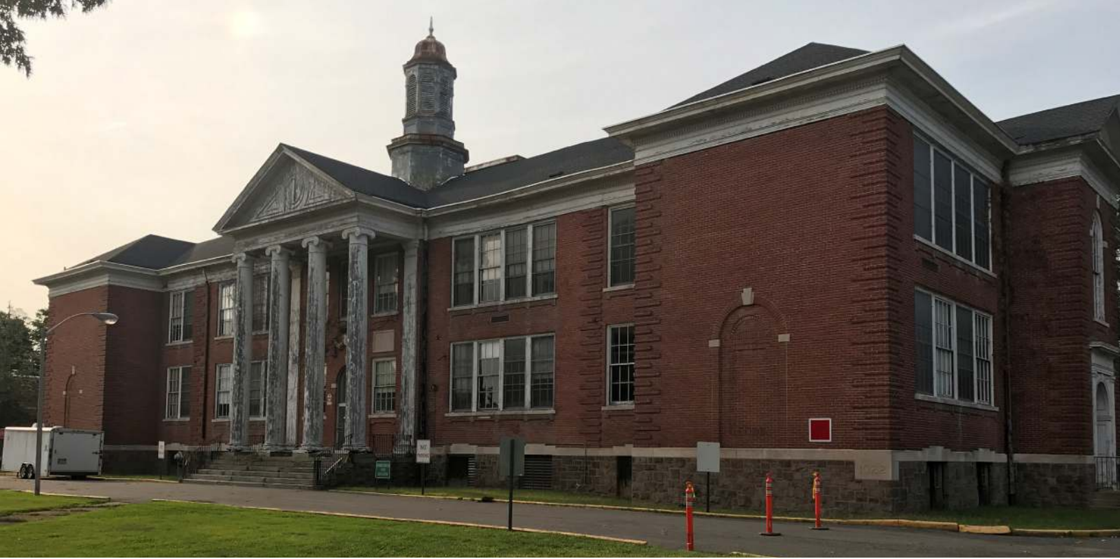
Next to Haves sits the Bordentown School's Administration Building.