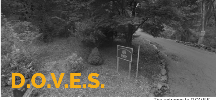
The entrance to D.O.V.E.S

Given the high rates of dual-system involvement and mental health concerns among the state's incarcerated girls—as of June 1, 2017, two-thirds of our state's incarcerated girls have been involved with both the child welfare system and the youth justice system, and all of them have a mental health diagnosis —every effort should be made to evaluate whether there are currently effective and rehabilitative out-of-home placements available for these young women through the child