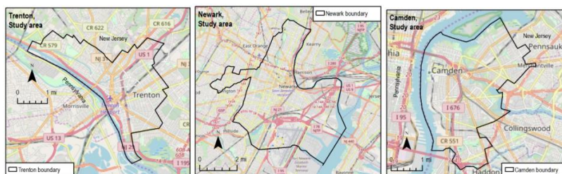
Figure 3: Maps of review area boundaries in Trenton, Newark, and Camden, New Jersey

First, the Institute set out to inventory existing state-recognized services through an online data review led by Dr. Geoffrey Fouad. The review examined asset data available online for Camden, Newark, 9 and Trenton (Figure 2). The online data review focused on assets for youth under the age of 18. 10 Dr. Fouad compiled the information from the online data review into GIS maps that included the following: 1) community asset points, such as community centers, treatment facilities, and educational institutions, and the locations of these asset points; 2) assets per total population; and 3) assets per minor population. The GIS database included ten forms of community assets and data review findings (Table 2). For details, see GIS Services for Asset Mapping Project – Final Report . The maps are posted here https://arcg.is/1KQcqqK .